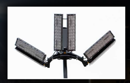
Adjustable light anywhere between 180° and 360°