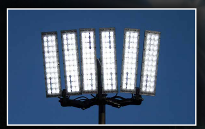
Directional area flood lighting